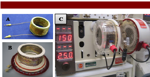
Figure 1. (A) A copper flow coil. (B) A high-temperature CTFR with the top metal jacket removed (1.0 mm i.d. tubing). (C) Heated CTFRs using a standard Vapourtec R4 heating module.

part of our efforts to develop methods of chemical synthesis in flow, we now report a simple and expeditious means for conducting a variety of useful copper-promoted reactions 6 using a commercially available copper tube reactor. 7