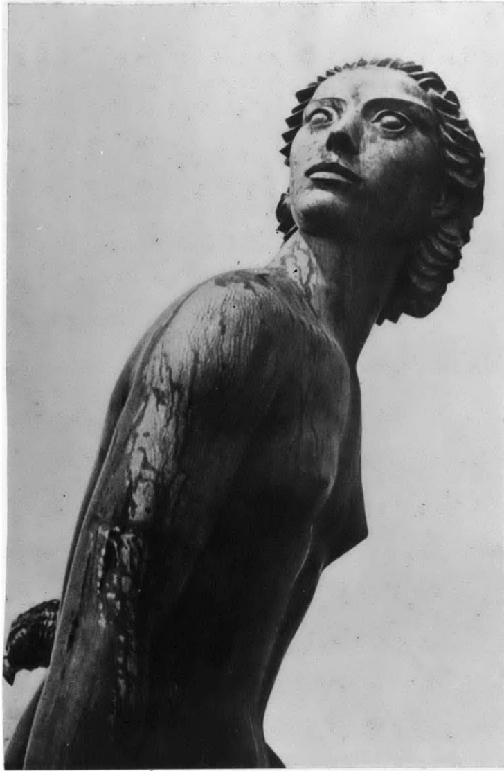
Figure 9 - Coordinate