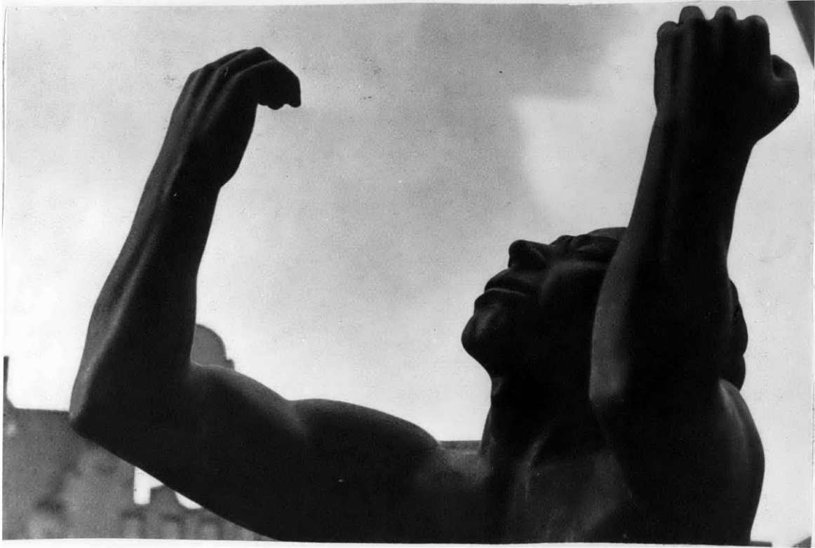
Figure 3 - Design