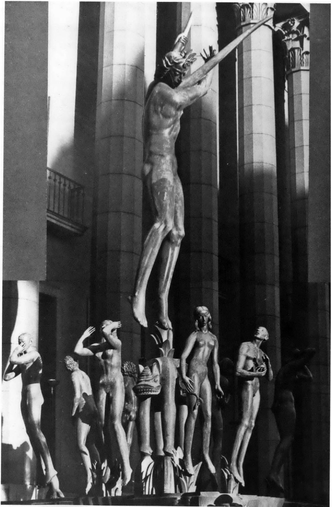
Figure 1 - Overview