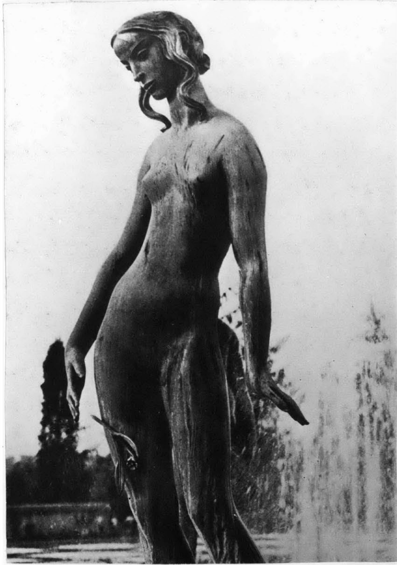
Figure 7 - Govern-Politick