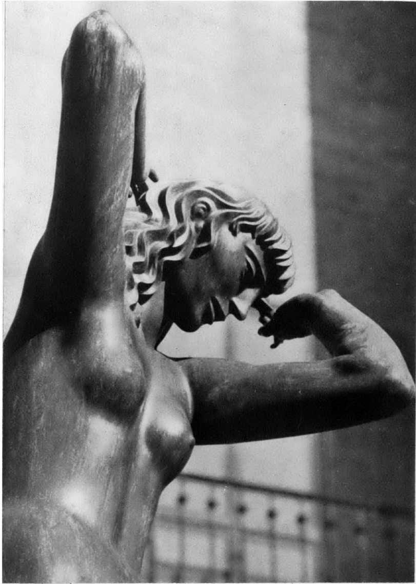
Figure 8 - Build A Career