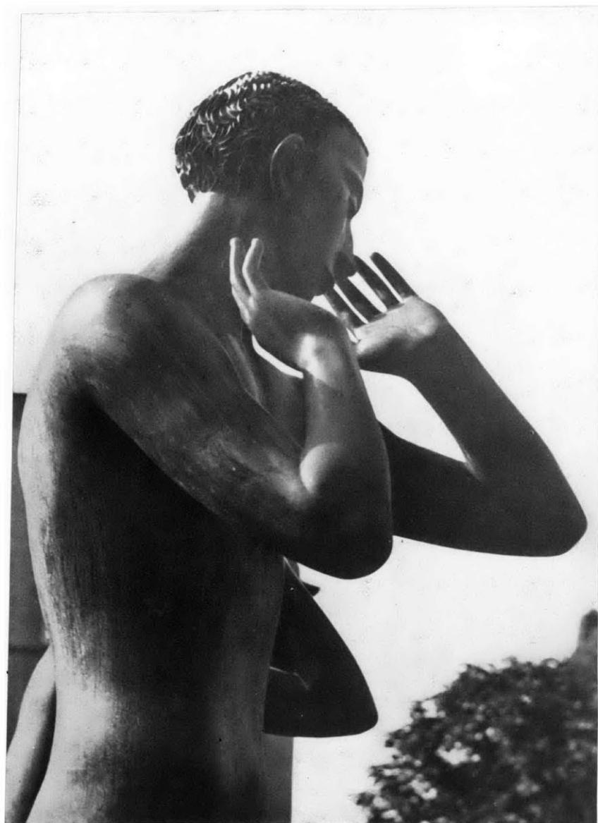
Figure 6 - Socially Improve