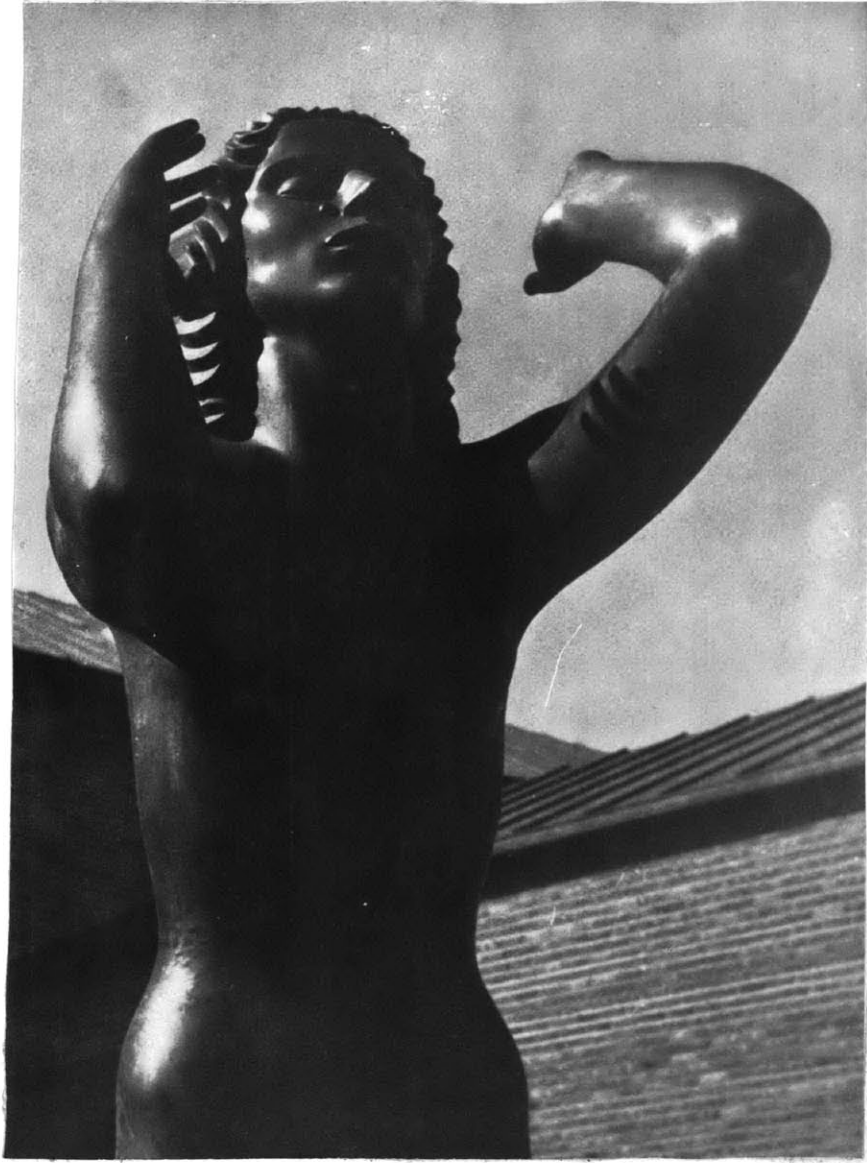
Figure 4 - Be technological