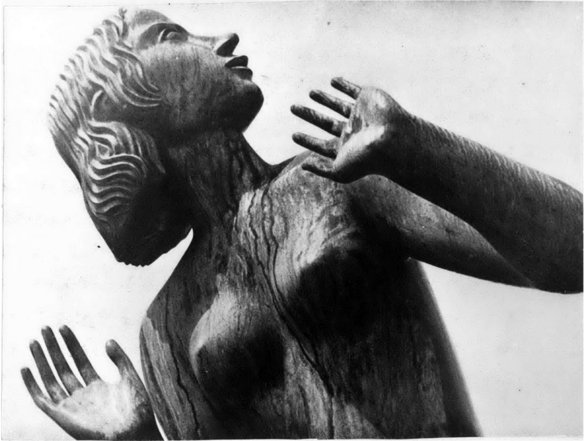
Figure 2 - Be Scientific