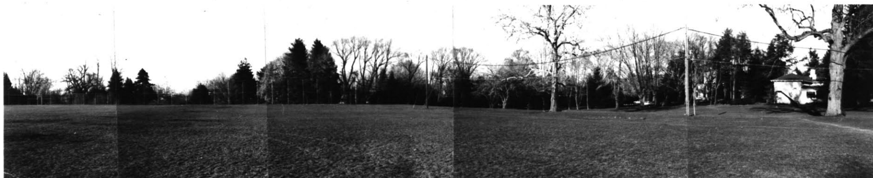
1. View toward the site from the soccer field