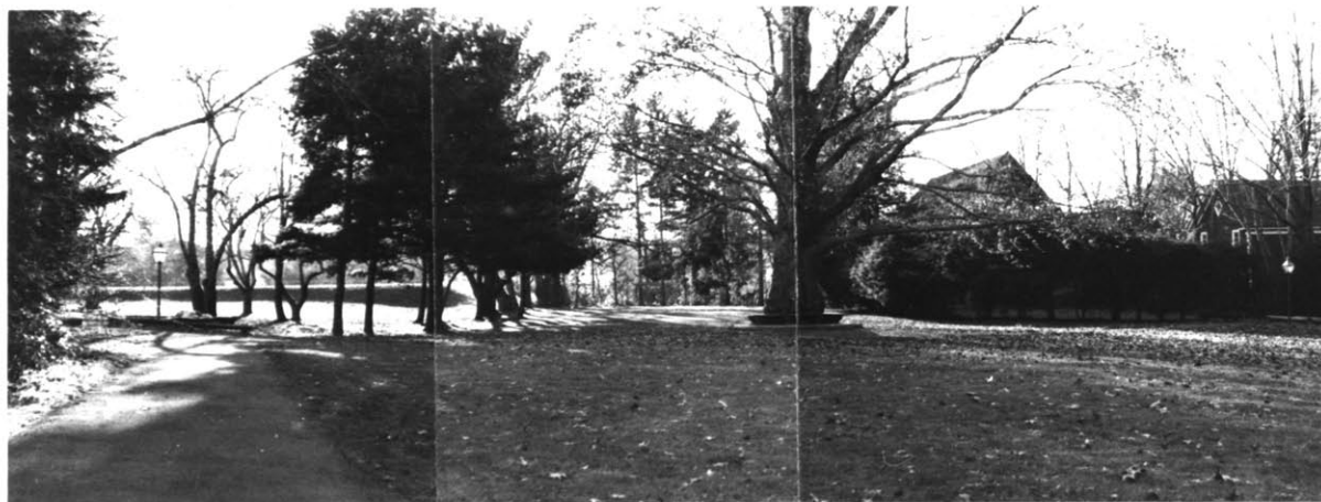
3. View toward the site from the infirmary