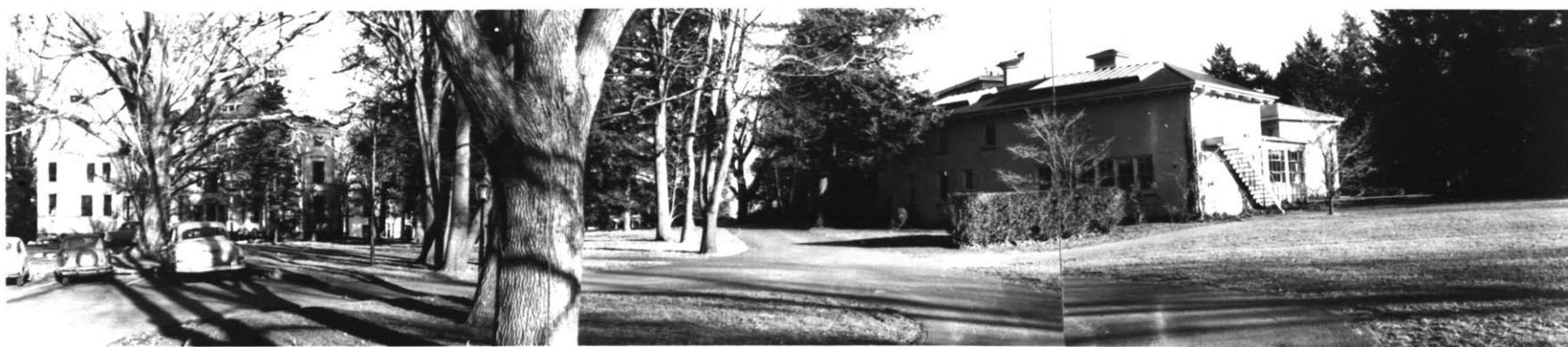
4. The Davison Art Center from the north-west