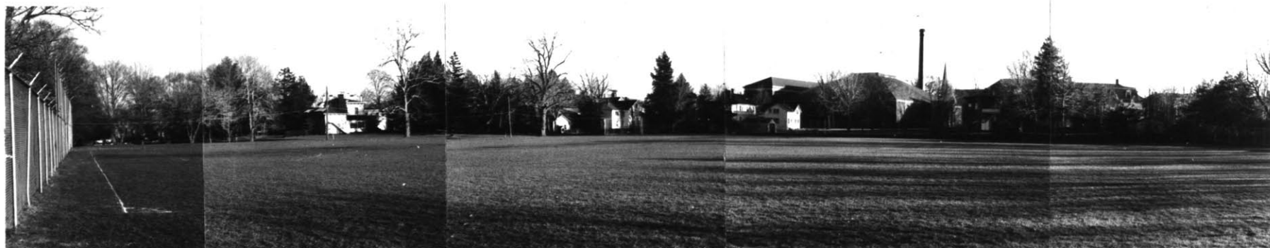
2. View toward the fieldhouse from the soccer field