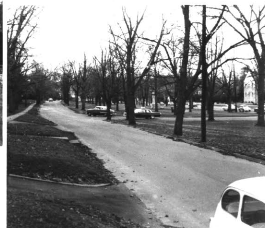
5. Washington Terrace, looking west.