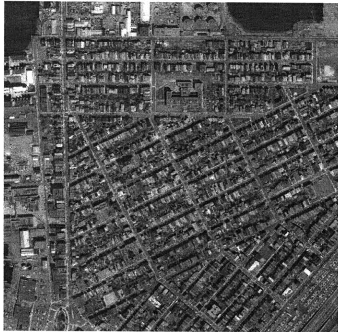
Exhibit 2-3 Upham's Corner