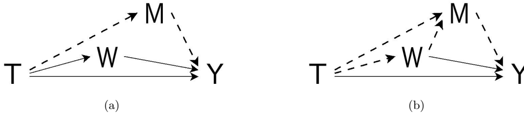
Figure 1: Causal Diagrams with Multiple Causal Mechanisms. In Panel (a), the treatment variable T can affect the outcome variable Y either through the mediator of interest M (red arrows), through alternative mediators W , or directly (solid bottom arrow). In addition, the causal relationship between M and W is assumed to be non-existent. Panel (b) represents an alternative scenario where W can affect Y either directly or through M , thereby allowing for the potential causal relationship between M and W . The quantity of interest for the proposed methods is the average causal mediation effect with respect to M , which is represented by the red arrows connecting T and Y through M in both panels.

framing effects, which we use as illustrative examples throughout this paper. All of these studies investigate how issue frames affect opinions and behavior through multiple causal pathways, such as changes in perceived issue importance or belief content. To identify these multiple mechanisms, they rely on a traditional path-analytic method which, as we show, implicitly assumes the absence of causal relationship between the corresponding mediators. This assumption is problematic from a theoretical point of view because, for example, framing may also alter the perceived importance of the issue by changing the factual content of beliefs (Miller, 2007).