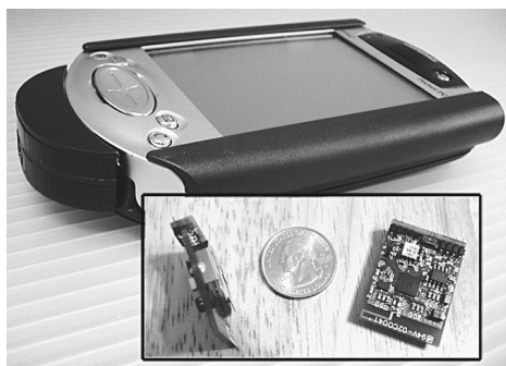
Figure 16-2. Mobile MITes.

Dramatic improvements in the size, performance, and comfort of on-body physiological sensors for ambulatory monitoring are being made in laboratories, and