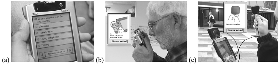
Figure 16-1. Screen shots of MIT CAES software.

particular part of the community, as determined by a GPS receiver plugged into the PDA and a GIS database.