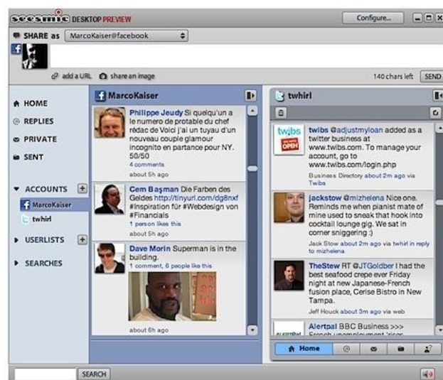
Figure 1. Seismic Desktop ( http://blog.seismic.com/2009/04/facebook.html ).

Our solution is named SNeSSI, an acronym for “Social Networking Site Security Interface”. The implementation of SNeSSI makes use of the open source features of the most popular SNS, such as Facebook and Twitter. The API (application program interfaces) for these offer software developers the ability to feed communication between the user and the site through a filter (the SNeSSI), that can monitor and intercept data streams, and advise a user should their actions raise cause for concern. A very simple example of such an interface, called the Seismic Desktop, has been developed to demonstrate the functionality of Facebook’s recently released Open Stream API, as shown in Figure 1.