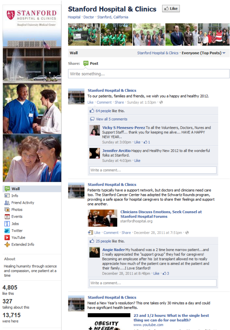
Figure 1: Sample Facebook Page for a Hospital