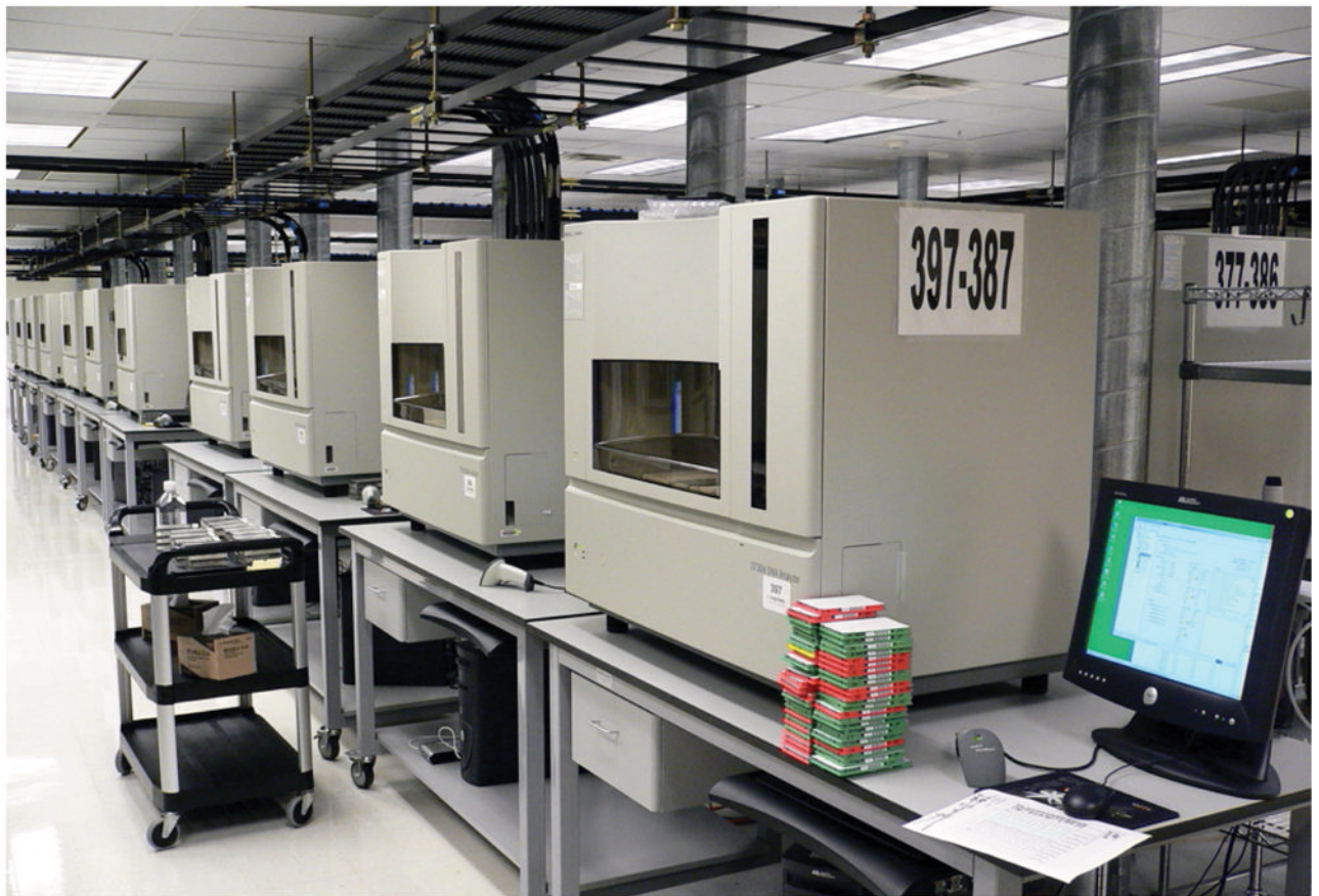
Figure 1. One of many rows of ABI 3730xl automated DNA Analyzers for shotgun sequencing of the human genome in months (30 billion bp/year) in 2005.