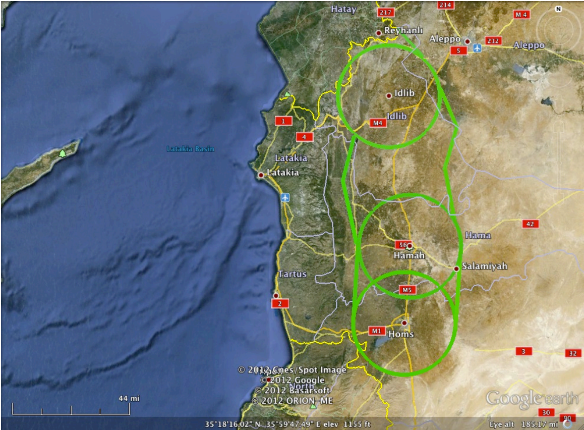
Figure 3: Safe Havens in Northwest Syria

Note: This map is notional. It is only intended as an illustration for the purposes of this analysis.