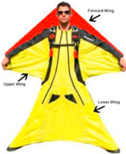
Fig 1. Redesigned Wingsuit. [3].