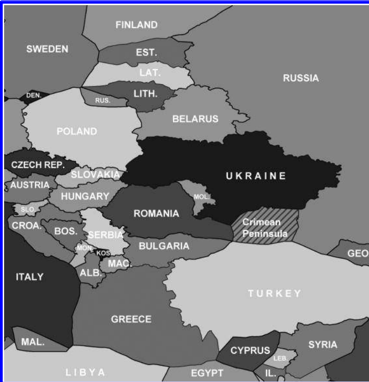
Rafi Segal and Yonatan Cohen. Territorial Map of the World, 2013. Detail showing the Black Sea region before (top) and after (bottom) the Russian annexation of the Crimean Peninsula.

Pages 52–55: Rafi Segal and Yonatan Cohen. Territorial Map of the World, 2013.