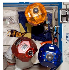
Figure 1: SPHERES satellites aboard the ISS

The SPHERES project, Synchronized Position Hold Engage Reorient Experimental Satellites project, is a formation flight testbed operating inside the International Space Station (ISS) developed by the Massachusetts Institute of Technology (MIT). The objective is to provide a fault tolerant environment to perform cutting edge research for algorithm development in fields such as estimation, docking, formation flight, reconfiguration, fault detection and path planning.