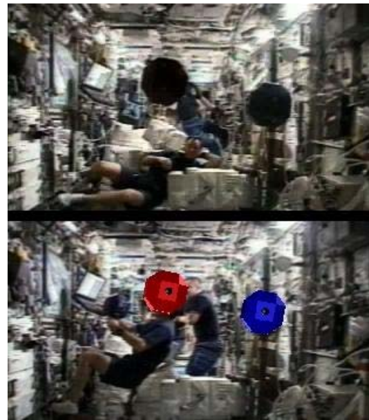
Figure 5: ISS image (top) vs Animation of ISS telemetry in same perspective (bottom)

Apart from the benefits to real-time operations, video data provided the ability to determine correct operations of the global metrology system. To demonstrate the performance of the metrology system, telemetry data was used to super-impose a CAD model of the satellites over a graphic of the ISS with the same perspective as the actual video (Figure 5). Comparison of the two videos demonstrates high accuracy of the global metrology system.